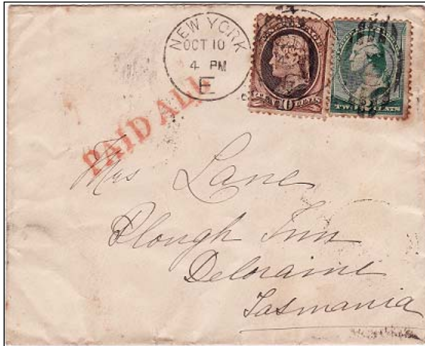
1889 'Paid All' cover New York to Deloraine, Tasmania – single 12c treaty rate Correct use of the 'Paid All' marking

The second cover was sent from New Jersey via San Francisco in 1890. The cover again bears the serifed 'Paid All' mark applied in New York. I have not sighted the backstamps to determine the exact sailing.