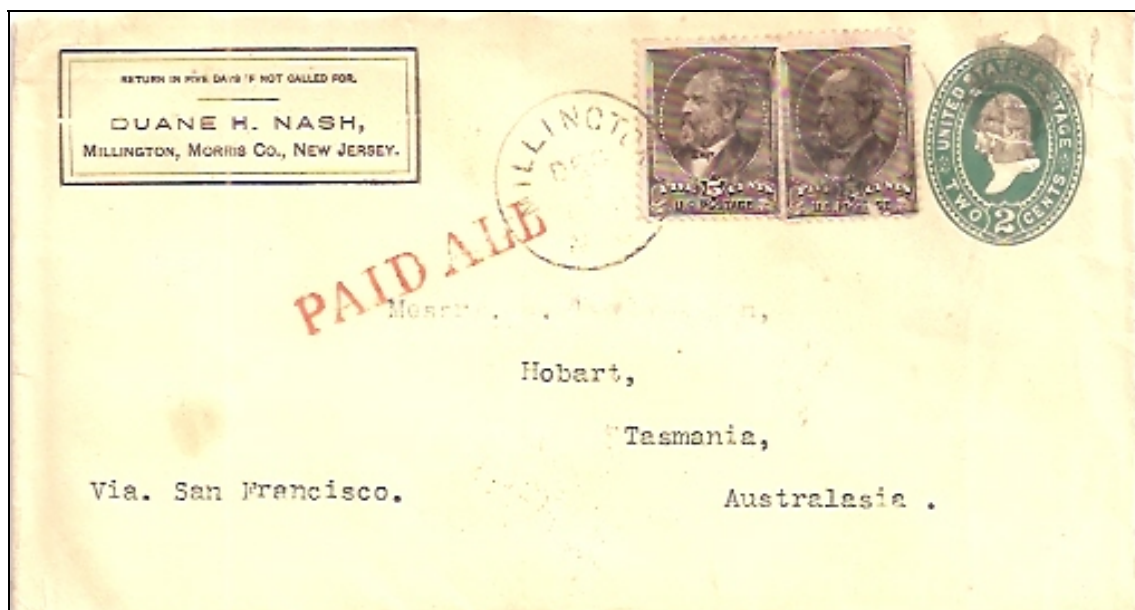
1890 'Paid All' cover New Jersey to Hobart, Tasmania – 12c treaty rate and endorsed 'Via San Francisco'

The second cover was sent from New Jersey via San Francisco in 1890. The cover again bears the serifed 'Paid All' mark applied in New York. I have not sighted the backstamps to determine the exact sailing.