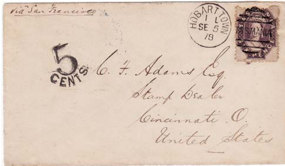
1878 cover Hobart Town to Cincinnati, Ohio taxed 5c on arrival in the United States

San Francisco. 5 The British Government agreed in 1873 to subsidise the carriage of mail to and from Galle, San Francisco and Singapore. The Colonies had to provide their own transportation to these points. Tasmania, not surprisingly, joined with Victoria in subsidising a P&O service to Galle. NSW opted for a Trans-Pacific route to San Francisco. Tasmania was not a party to the Pacific contract but could participate in the NSW contract by paying an agreed amount to NSW. A 6d rate to England via San Francisco by the Orient Line was advertised to the Tasmanian public by a General Post Office notice dated 13 February 1880 6 although 6d rate mail via San Francisco has been seen from the late-1870s.