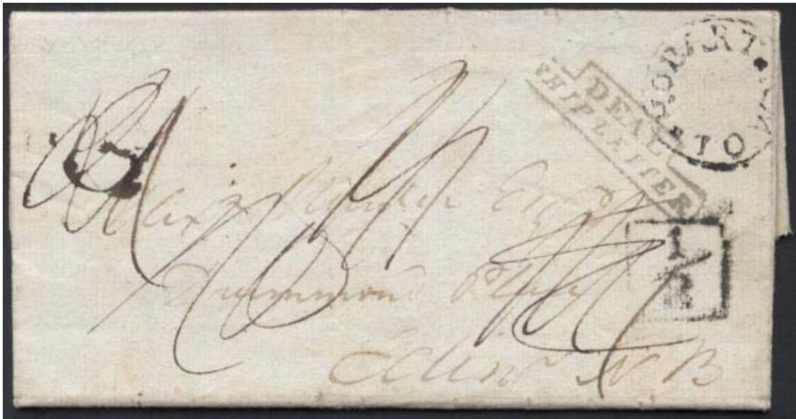
"Hobart Town" marking on 1820's letter to Edinburgh

The British Colony of Van Diemen's Land (VDL) was settled in 1803, the second Australian Colony to be established after New South Wales in 1788. VDL was established to forestall the French who were also seeking a colony in the southern oceans. The loss of the American Colonies during the War of Independence, the population influx to English cities during the Industrial Revolution and a harsh criminal sentencing system designed to protect personal property saw a dramatic rise in the numbers of British prisoners. From 1812, VDL became a dumping ground for British convicts. The island Colony became a 'prison without walls'. Many convicts were not permitted to return to their homeland with British military regiments sent to the Colony to maintain order.