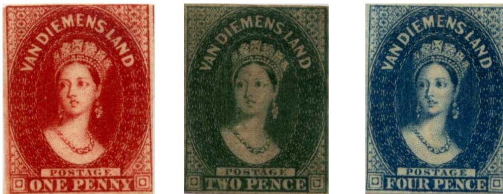
The 1855 1d, 2d and 4d Chalons

Three stamps were ordered from England – a 1d Red, 2d Green and a 4d Blue. The stamps were printed by Perkins Bacon of London using advanced die-making and recess-printing techniques. Perkins Bacon overlooked the requirement from the Colony and the stamps should be perforated and they were issued imperforate. The stamps depicted a young Queen Victoria with the design based upon a portrait painted by Alfred Edward Chalon in 1838. The stamps are of a superior quality and printed on ‘star watermark’ paper. In error, Perkins Bacon shipped the printing press along with the stamps which encouraged VDL to again print future stamps in the Colony.