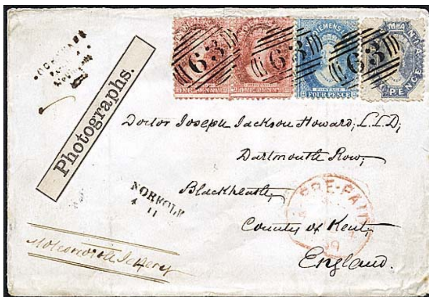
1869 cover from New Norfolk to England bearing a combination of Van Diemen's Land and Tasmania stamps (ex. Viney)

The name of the Colony was changed to 'Tasmania' in 1856 and this change was reflected in the postage stamps in 1858 when the 6d and 1/- values arrived from England. The 6d was necessary to meet the increase in the ship letter rate from 4d to 6d and the legislature was eager to attempt to eradicate the 'convict stain' associated with the name 'Van Diemen's Land'. The 1d, 2d and 4d chalon stamps still continued in use however (due to the vast expense of replacing the printing plates) and thus from 1858 until 1870 stamps bearing the 'Van Diemen's Land' and 'Tasmania' motifs can be found on the one letter.