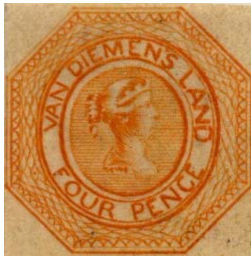
The 1853 1d and 4d Courier stamps

The Couriers were printed in a range of shades and on papers of varying thicknesses. The 4d was unusually, printed in an octagonal shape – probably influenced by an earlier 10d stamp from Great Britain, and examples can be found on original letters with the corners 'clipped'. Proofs of the 4d on laid paper are known although examples are rare.